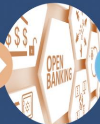
PSD2 OPEN BANKING